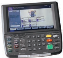
Newly designed, easy-to-use large color touch screen control panel