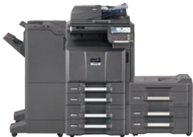
Shown with optional 175 sheet DSDP, 2 - 500 x 2 sheet paper trays, 500 sheet multi-purpose tray, and 4,000 sheet finisher