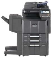
Shown with optional 175 sheet DSDP, optional 1,500 x 2 sheet trays, and 1,000 sheet finisher